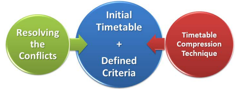
How Initial Timetable Is Improved by HOTS