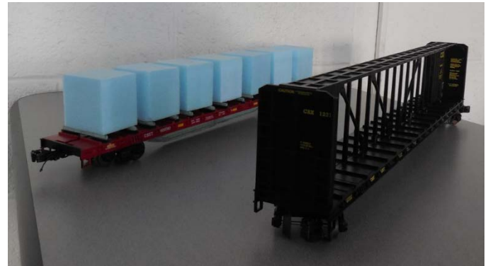
Figure 1. Model center beam car (right) and converted frac sand car with pods (left)

underneath the deck to mitigate the structural strengths lost in the removal.