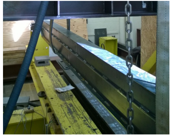
Figure 3. 1/4 scale prototype testing