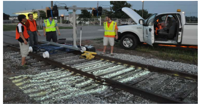
Figure 2. Field Test at the crossing (USDOT 719862A) on Beasley Rd. Versailles, KY.

foot overlapped area in the longitudinal direction with the other scans before and after it. Two scanned 3D point clouds were shown in Figure 3.