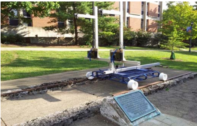
Figure 1. DAS prototype.

As a scanner platform, a rail cart was built to include a frame with wheels, a laptop computer with structured light data capturing software, an 1100 watt AC/DC converter, power cables, and power provided by the battery of a test vehicle as shown in Figure 1.