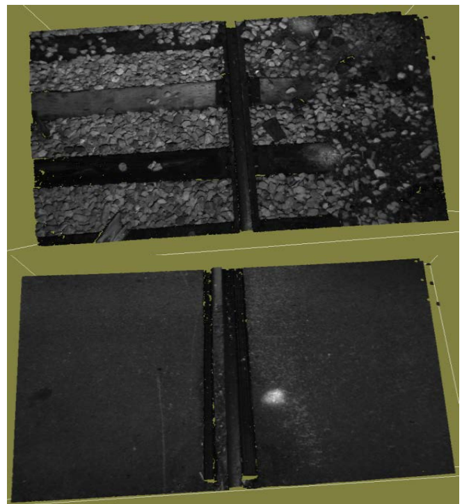
Figure 3. Sample of data collected in the field.